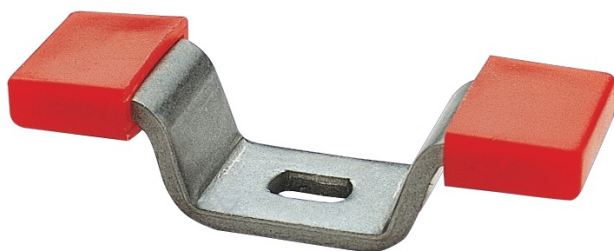
Farfalla in acciaio inox.